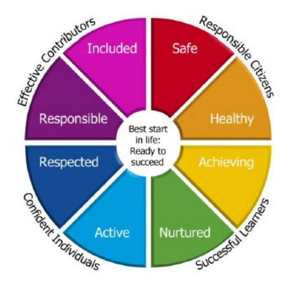
<Insert School statement re approach>

These 8 Wellbeing Indicators need to be met in order for children and young people to grow and develop into confident individuals, effective contributors, successful learners and responsible citizens.